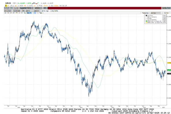
EURUSD Technical Chart 5y, Bloomberg