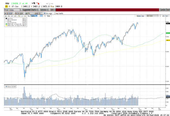
Performance Equity Markets MSCI World 5Y iii