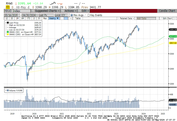
Performance Equity Markets MSCI World 5Y iii