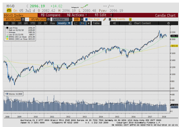
Performance Equity Markets MSCI World YTD v